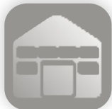
Warehouse Stock Management