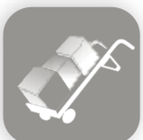
Packing and Shipping