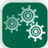
Manufacturing & Industry Entrances