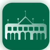
Governmental Institutions/ Facilities