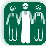
Construction Sites Workers Tracking