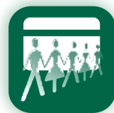
Clubs and Associations